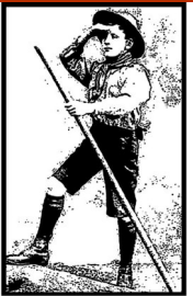
Boy Scouts Pancakes