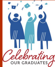
Celebrating OUR GRADUATES

If you have a son, daughter, grandson, granddaughter or other relative graduating from kindergarten, middle school, high school, technical college or a university, please fill out a form (found on the parlor table), so they may be recognized Graduation Sunday, May 6, 2018 during our Worship Service.