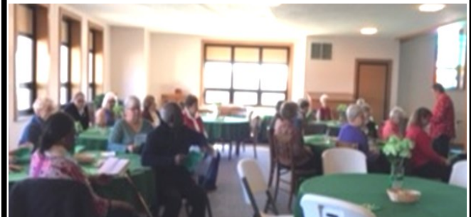
Held at First Christian Church