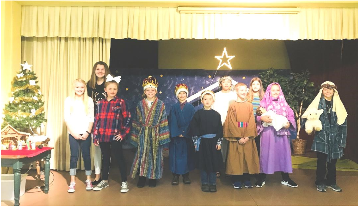
Cast of "Christmas Hope", play production of First Christian Church Sunday School Program 12/10/17.