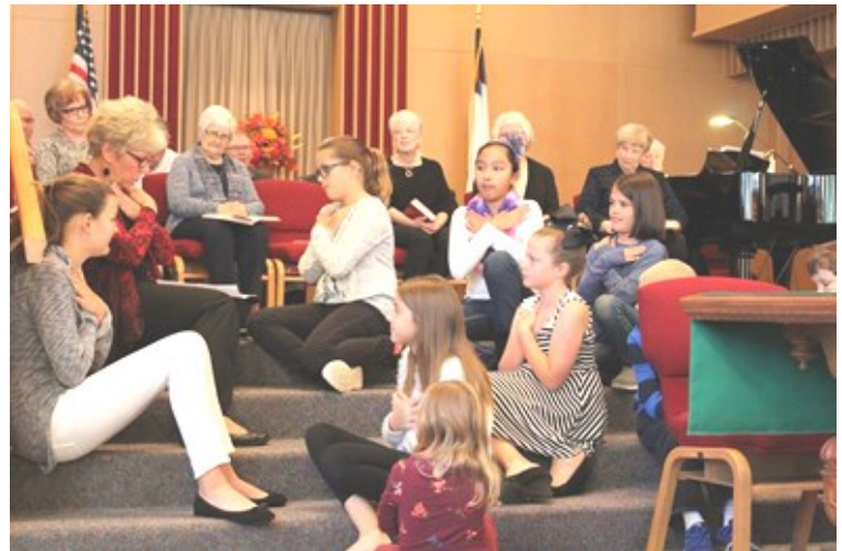
Children's Message Sunday, December 10, 2017