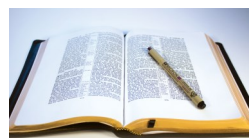
BIBLE STUDY GROUP

Life is about using the whole box of crayons.